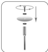
cut off wheel