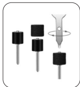
sanding drum kit

Mandrels are shanks with a threaded screw head used for , cut-off wheels, sanding bands, and felt wheels. Details see below figures.